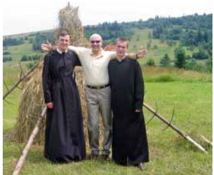
UCEF donors support the education of more than 200 seminarians at the Ukrainian Catholic University.