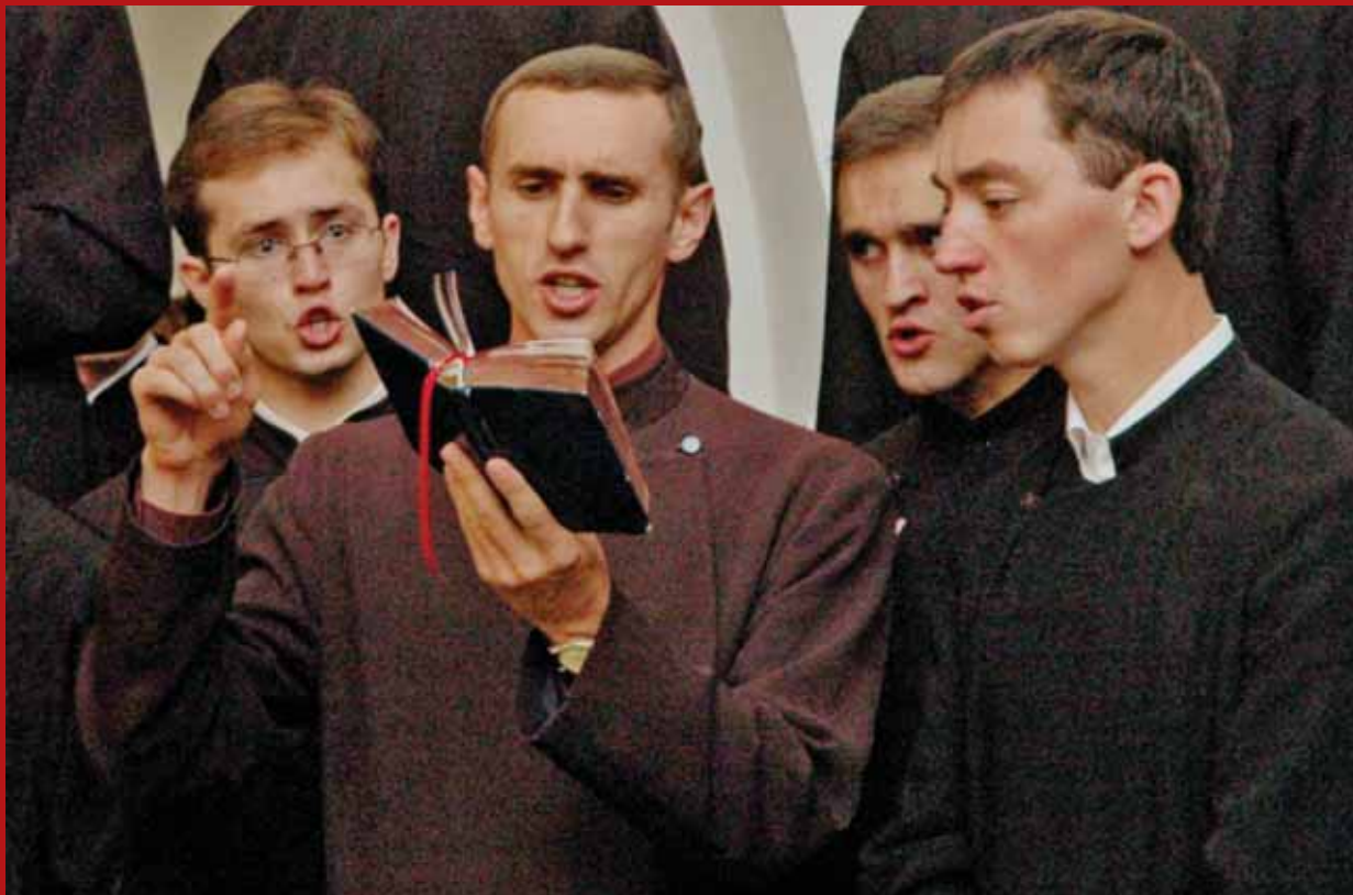
Seminarians sing for the Liturgy at the inauguration of the new classroom building of the Ukrainian Catholic University.